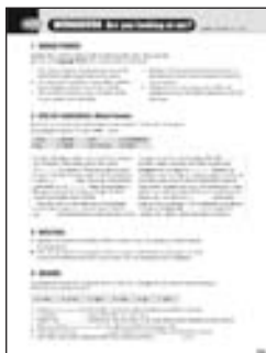
Grammar, Vocabulary Use of English, Idioms, Writing, Speaking Strategies