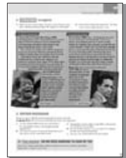
Page 4: CLIL, Further Discussion, Your Answer