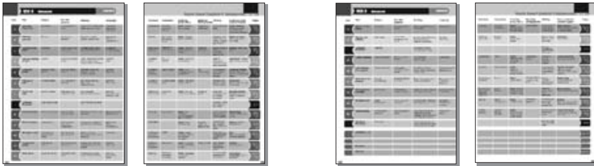
Contents pages Student's Book and Workbook (see also Materials Map pages 4–7 of this Teacher's Guide )