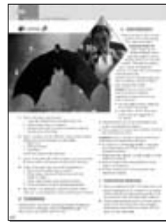
Page 3: Listen / Watch and Listen, Teamwork, Controversy, Portfolio Writing