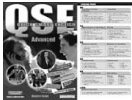
20 Language Banks, on the cover flaps