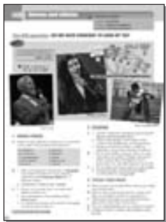
Page 1: Viewpoint: Word Power, Reading, Speak Your Mind