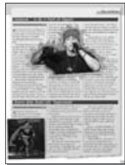
Page 2: Reading texts (two texts per unit)